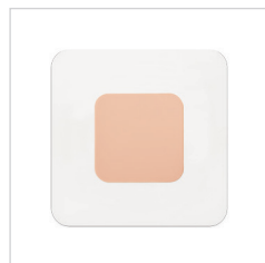
CovaWound™ Adhesive Foam