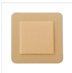
CovaWound™ Silicone Border & Silicone Border Lite