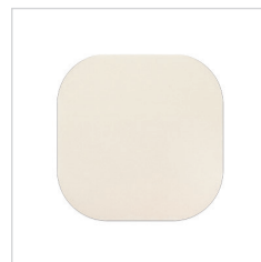
CovaWound™ Hydrocolloid & Hydrocolloid Thin/ Transparent