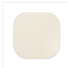
CovaWound™ Hydrocolloid & Hydrocolloid Thin / Transparent