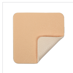
CovaWound™ Silicone & Silicone Lite